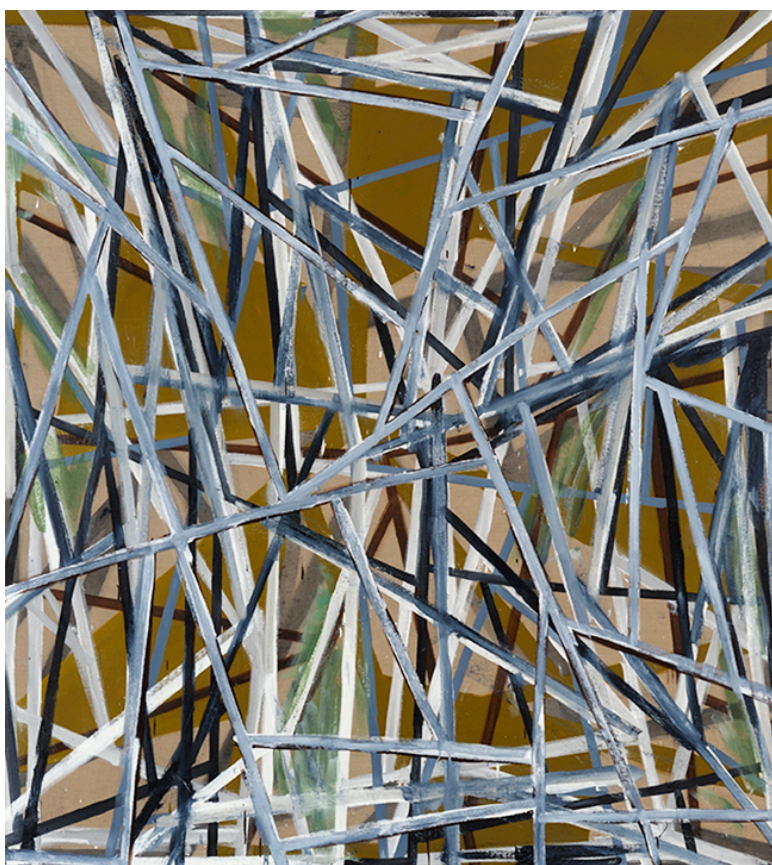
"Wheel House", 2013, oil on linen, 92 x 83 inches

In its spiky avidity, "Wheel House" might even read as a rejoinder to the edge-to-edge lyricism of Brice Marden's loopy abstractions, though Arnoldi's picture clearly grew out of his own earlier work such as the 1986 example here - an actual thicket of painted sticks attached to painted plywood.