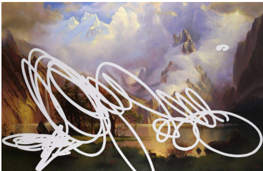
'The Most Beautiful Place Is Far From Here' (Rocky Mountain Scene, White House Art Collection Erasure No. 16)